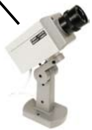
Ethernet Based Camera