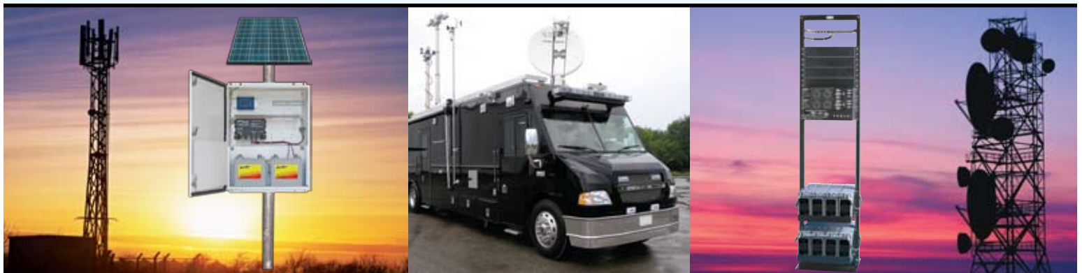
Cell Sites ▪ Mesh Radio Networks & Outdoor Enclosures ▪ Command Vehicles ▪ Rack Power Systems ▪ Microwave Hubs

Sites without internet access can use the monitor solely as a data logging instrument that captures and retains a 30 day history file, ready for download to a lap top computer during maintenance visits for recording site history and analysis of component performance and failure conditions.