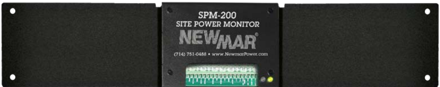
SPM-200 with optional rack mount panel for 19/23" racks