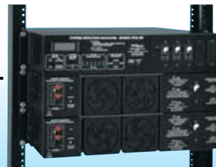
Site Power System ■ Alarms - Major/Minor ■ Voltages ■ Current ■ Temperature