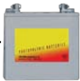
Battery ■ Voltage: 12/24/48 ■ Charge/Discharge Current