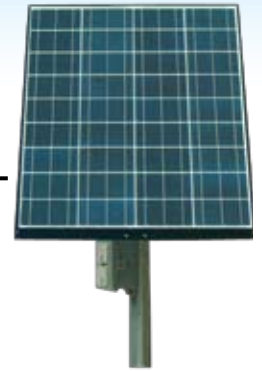
Solar Panel Voltage