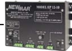
Enclosure Power Supply ■ DC Voltage ■ DC Current