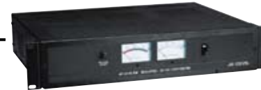
DC Converter ■ Input/Output Voltage ■ Output Current