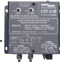
Low Voltage Disconnect ■ Disconnect Status ■ Battery Voltage