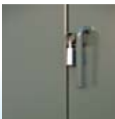
Door Open Alarm