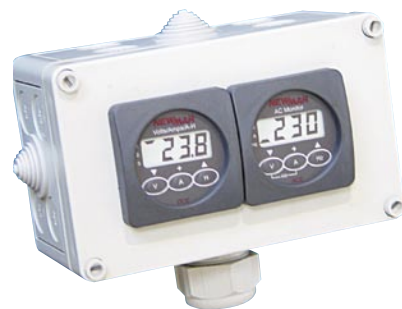
Application example - EX-474 shown with digital instruments mounted in cover